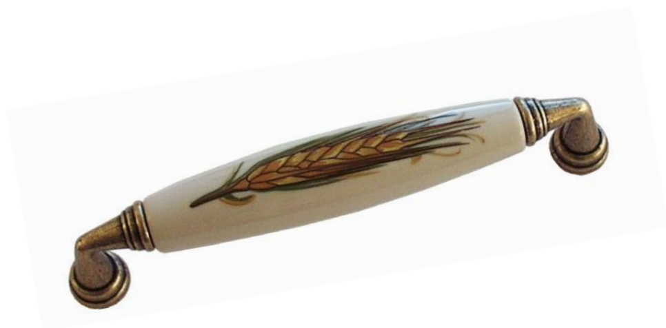
Ref. 902 Tirador ABS / ZAMAK 144 x 34 x 22 mm 128 mm entre taladros