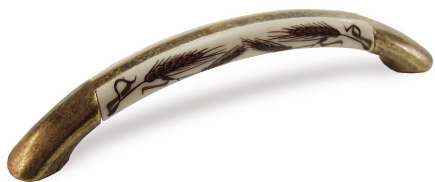
Ref. 699 Tirador ABS / ZAMAK 147 x 31 x 15 mm 128 mm entre taladros