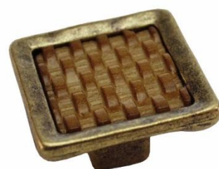
Ref. 657 Pomo ABS / ZAMAK 31 x 31 x 19 mm 1 taladro central