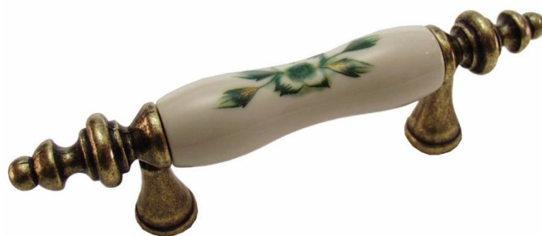
Ref. 641 Tirador ABS / ZAMAK 116 x 32 x 17 mm 64 mm entre taladros