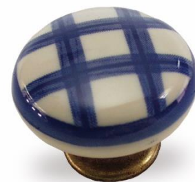
Ref. 300A Pomo ABS / ZAMAK 34 x 26 mm 1 taladro central