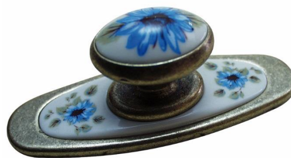
Ref. 665 Tirador ABS / ZAMAK 96 x 37 x 30 mm 1 taladro central