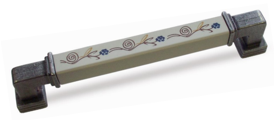
Ref. 911 Tirador ABS / ZAMAK 211 x 37 x 20 mm / 192 mm entre taladros 179 x 37 x 20 mm / 160 mm entre taladros 147 x 37 x 20 mm / 128 mm entre taladros