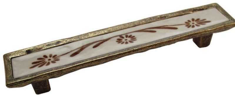
Ref. 656 Tirador ABS / ZAMAK 126 x 20 x 23 mm 96 mm entre taladros