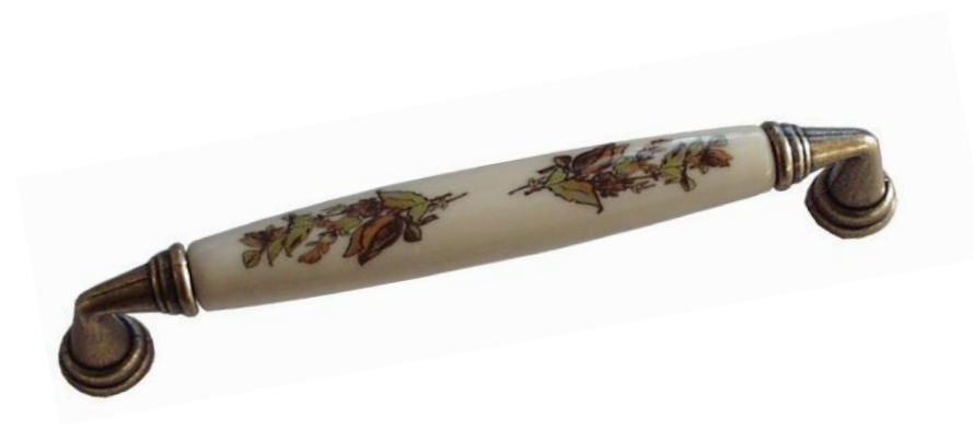
Ref. 901 Tirador ABS / ZAMAK 144 x 32 x 16 mm 128 mm entre taladros