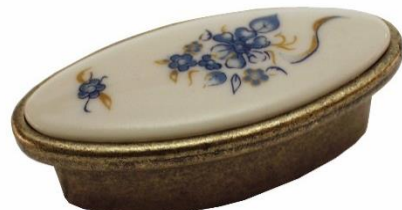
Ref. 645 Pomo ABS / ZAMAK 60 x 23 x28 mm 32 mm entre taladros