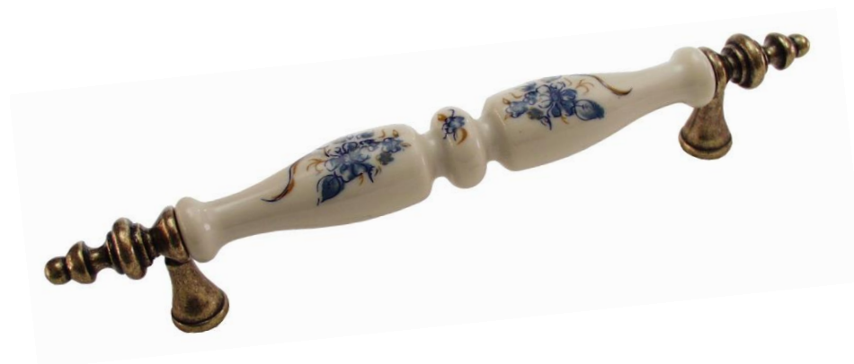
Ref. 644 Tirador ABS / ZAMAK 180 x 33 x 19 mm 128 mm entre taladros