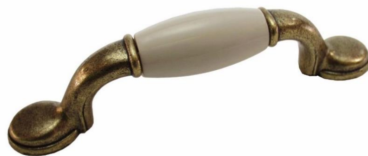
Ref. 642 Tirador ABS / ZAMAK 127 x 32 x 18 mm 96 mm entre taladros