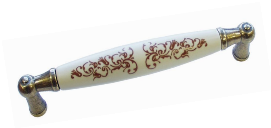
Ref. 903 Tirador ABS / ZAMAK 144 x 26 x 17 mm / 128 mm entre taladros 108 x 26 x 17 mm / 96 mm entre taladros