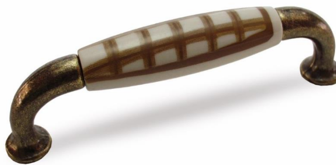
Ref. 640 Tirador ABS / ZAMAK 110 x 32 x 16 mm 96 mm entre taladros