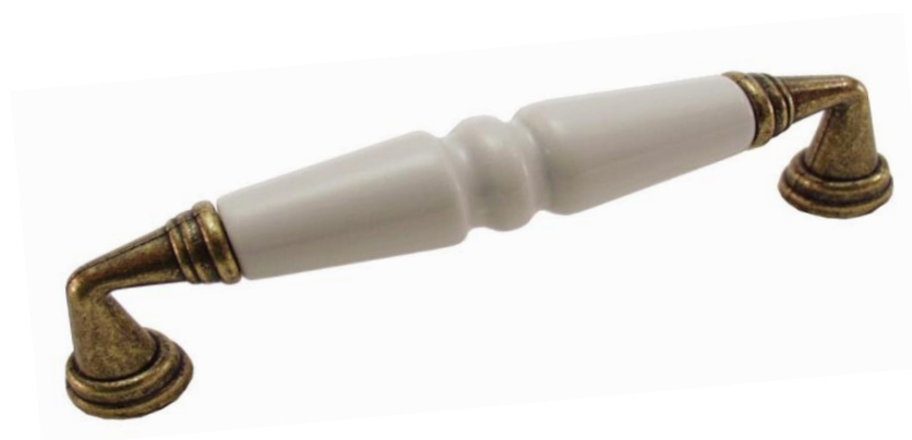
Ref. 648 Tirador ABS / ZAMAK 144 x 34 x 19 mm / 128 mm entre taladros 112 x 33 x 18 mm / 96 mm entre taladros