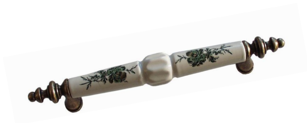
Ref. 900 Tirador ABS / ZAMAK 180 x 33 x 19 mm / 128 mm entre taladros 148 x 33 x 19 mm / 96 mm entre taladros