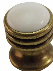
Ref. 646 Pomo ABS / ZAMAK 20 x 25 mm 1 taladro central